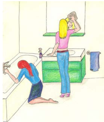
Mum and Paula clean the bathroom.